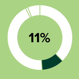
Implemented, not expanding/upgrading