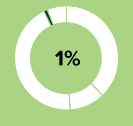
Decreasing or removing